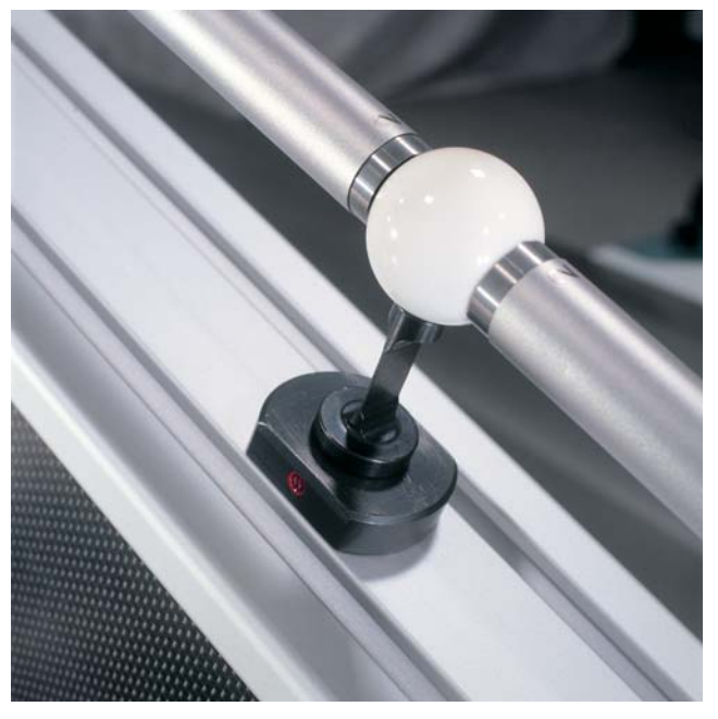
Figure 2: Ball on the spring element between two distance tubes

have been lined up by means of a clamping unit with reproducible force in the axial direction and support themselves upon a fixed skewback (springer) at the opposite end. Thereby changes in the length occurring due to the varied pre-stress forces are avoided.