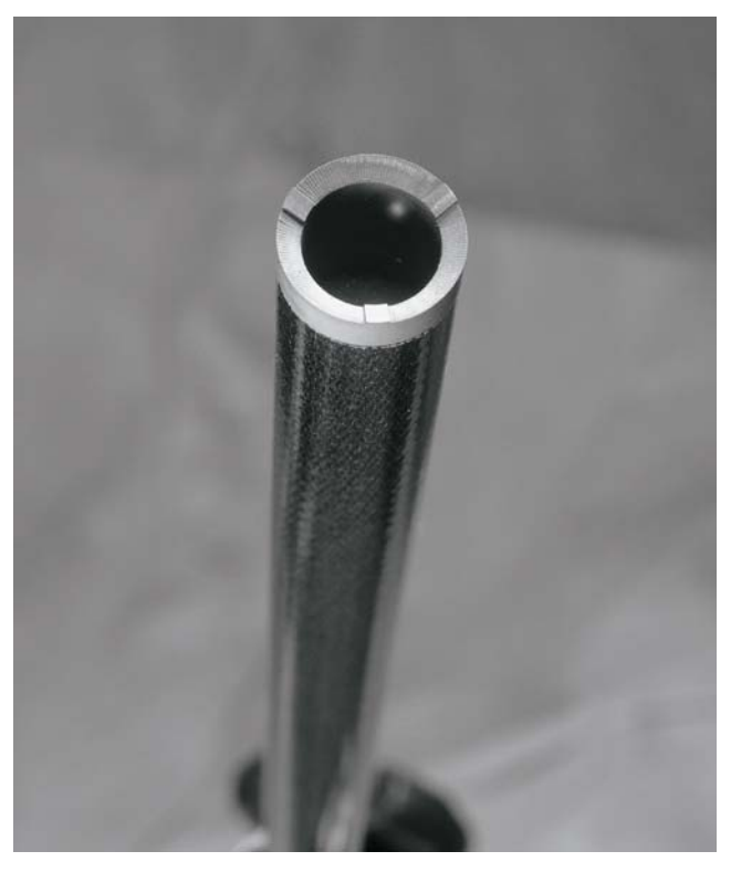
Figure 4: CFC-tube with carbide 3-point contact

Distance tubes of CFC-material with coefficient of thermal expansion of 0 do not react to fluctuations in temperature and merely show the uncertainty of measurement of the measuring instrument without any influence of the environmental conditions.