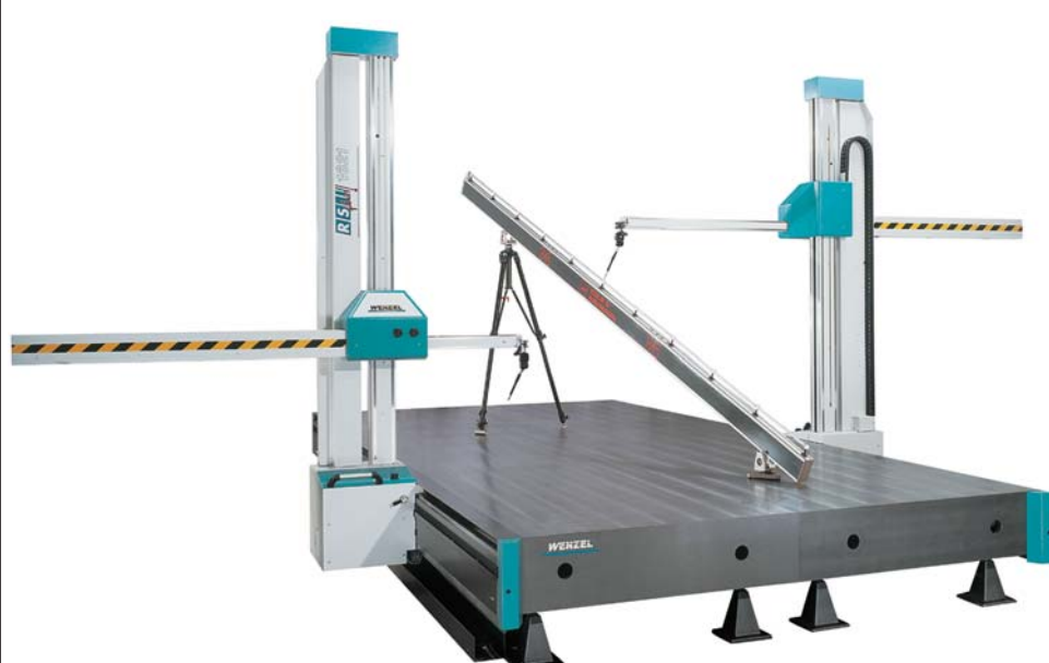
Figure 1: KOBA-Ball Bar on a CMM of horizontal arm type

KOBA-Ball Bar with its constructive features represents a suitable monitoring standard for this task. The basic concept of the equipment is based on a patented idea originating in the year 1989 (Patent application P 3930223.7), which was further developed into a dismountable test body by the PTB. The constructive transformation by Kolb & Baumann was carried out in a close collaboration with the PTB and the automobile industry.